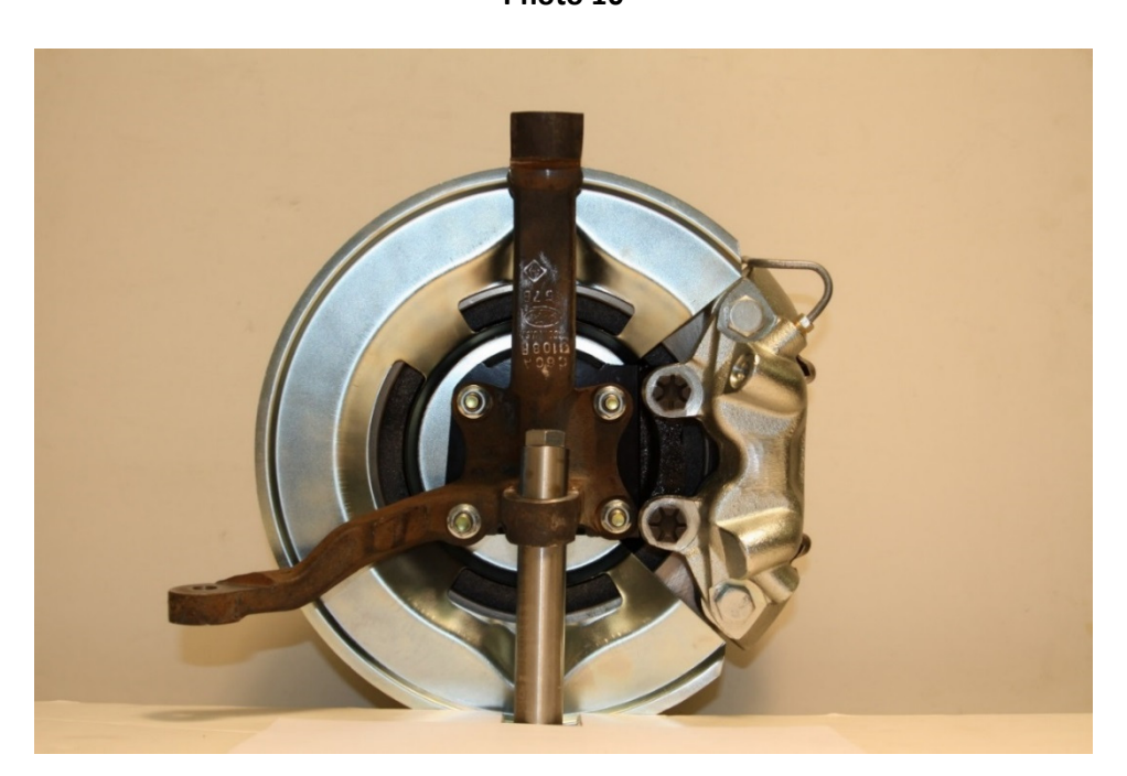
Front of Car →