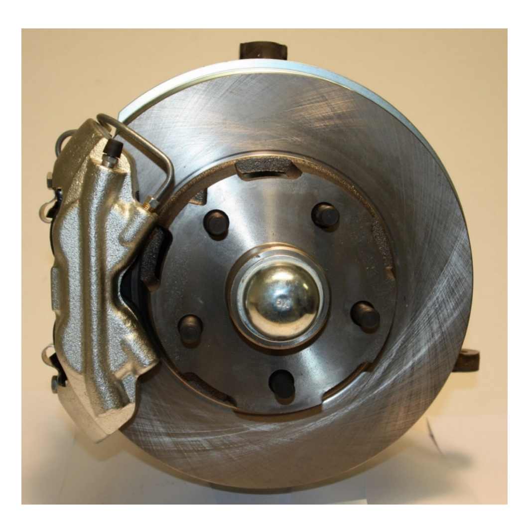
← Front of car